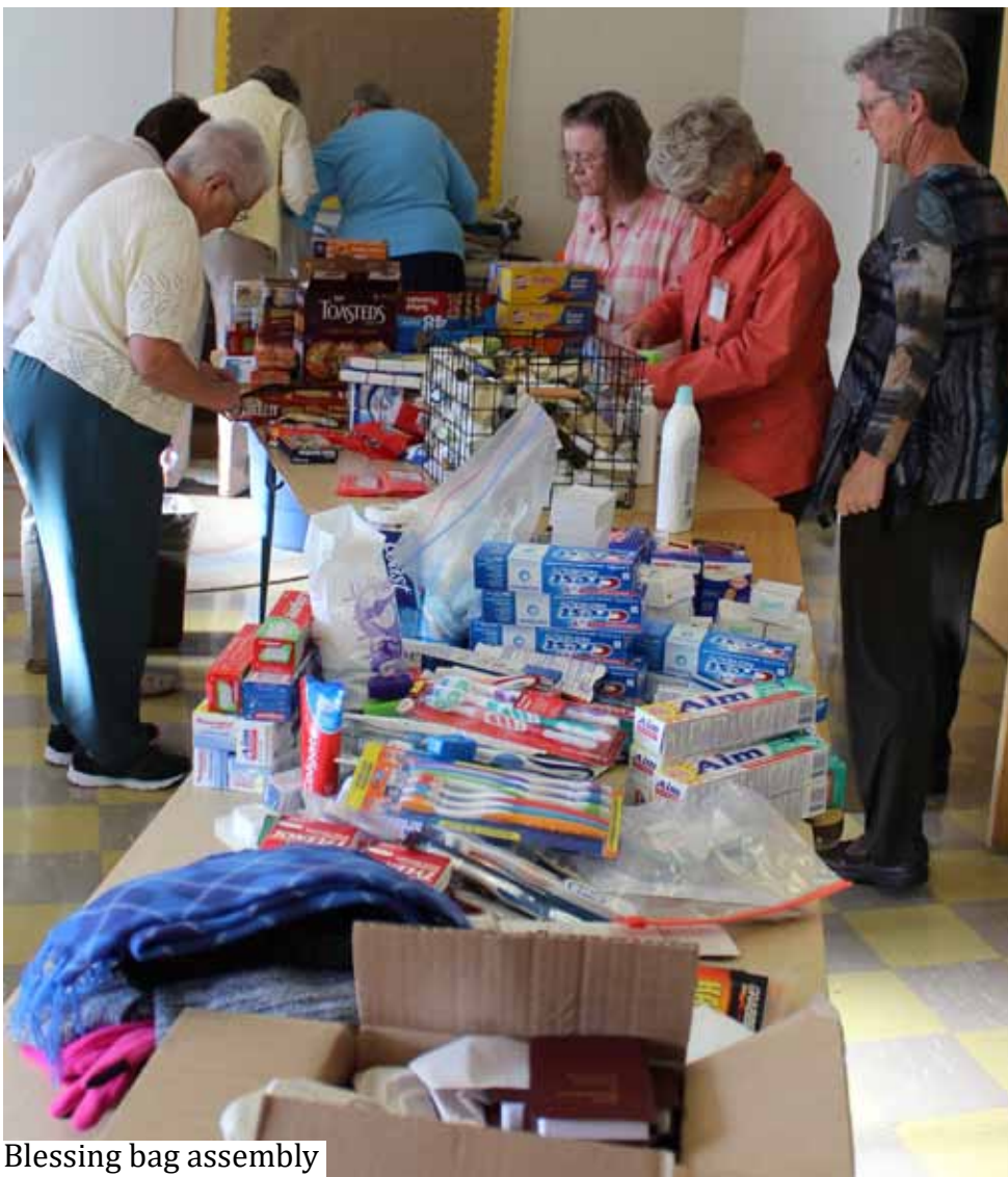
Blessing bag assembly

Seventeen School kits were partially assembled and will be completed and sent to Lutheran World Relief for use around the world.