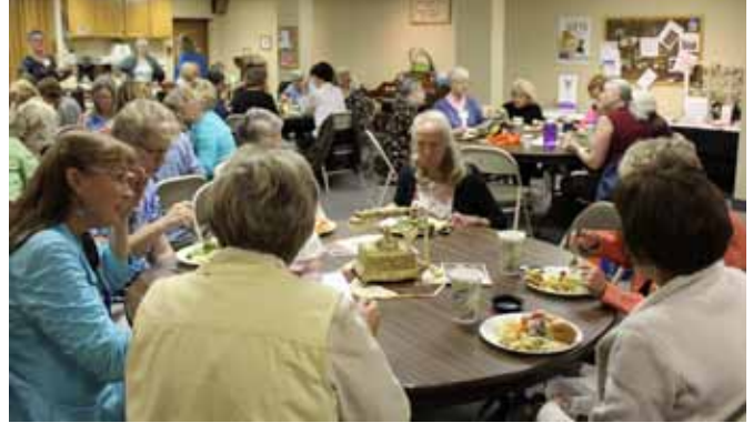
Participants enjoy the wonderful food.

fold theme to ground us in ways God calls us to love Him and all those whom we encounter. Inspirational!